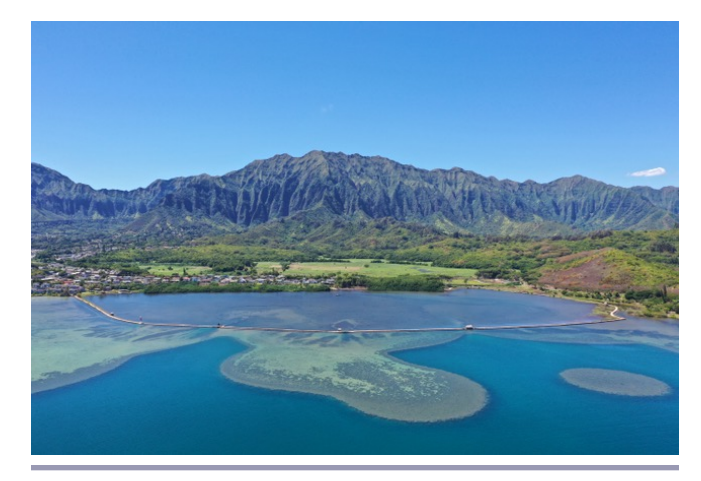
Fig. 3. An aerial view of He'eia Fishpond, the largest Indigenous aquaculture system in He'eia, which covers approximately 36 hectares (88 acres) of the estuary and is stewarded by Paepae o He'eia (a comanagement partner in the He'eia NERR). It is estimated to be approximately 800 years old, and, after falling into disrepair and being inundated with invasive mangroves for several decades, has been the focus of biocultural restoration efforts since 2001.

As a result of this study, government agencies have a better understanding of the connection between removal of invasive mangrove and improvements to water quality. This restoration project is now held up as a model for sustainable development in policy circles, especially those around the state-sanctioned Hawai'i Green Growth initiative and the Sustainable Hawai'i goals.