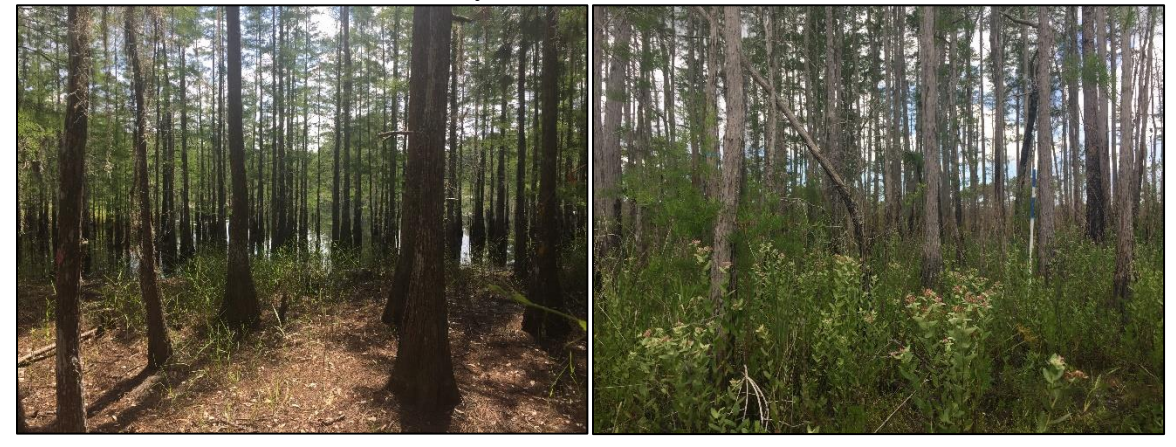
Figure 3-4: Two wetlands being considered for the field-study where managers may categorize the left wetland as healthy and the right as impaired based on inundation periods and wetland species presence, while residents may categorize both as healthy.

Objective 3: Evaluate predictors of resident perceptions about wetland health and engagement with water management decision-making including demographic factors and proximity to wetland degradation. Through this study, I can better understand what drives resident's understanding of wetland health and potentially what leads them to engage with managers or other residents in wetland protection. This final study will utilize resident interviews collected and archived by the University of South Florida that include both qualitative and quantitative responses. Through collaboration with local water management agencies and non-profits, these data can also be supplemented with information for residents that attend public