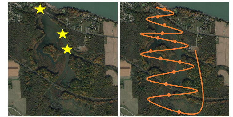
Figure 1. Left: Locations accessible for waterfowl point counts. Right: Possible drone route for waterfowl counts, with points indicating where pictures will be taken.

from waterfowl excretion, we will compare this to previously published external loading from the OWC watershed (11,594 kg Total P year <sup>-1</sup>, 136,022 kg Total N year <sup>-1</sup>, 1,067 kg PO<sub>4</sub><sup>3-</sup> year <sup>-1</sup>, and 97,782 kg NO<sub>3</sub> year <sup>-1</sup>) (21, 22). We selected Old Woman Creek due to readily available data from the extensive watershed monitoring program with a large dataset of nutrient concentrations entering and leaving the wetland, and calculated nutrient loadings to Lake Erie.