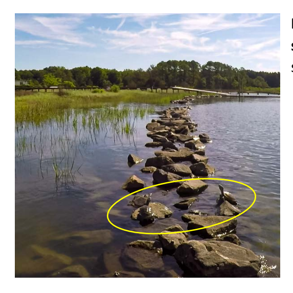
Figure 2 – Diamondback terrapin basking at a living shoreline. Two diamondback terrapin (circled) can be seen basking on the rock sill of the living shoreline.