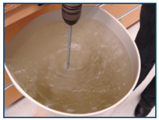
The researchers used a rotating paddle to create different levels of turbulence in the laboratory.

They compared the percentage of live and dead copepods collected from these sites using a dye that is only taken up by living copepods. The results of their comparison showed a much higher fraction of dead copepods in the channel (34%) than in the marina (5.9% dead) or along the shoreline (5.3%).