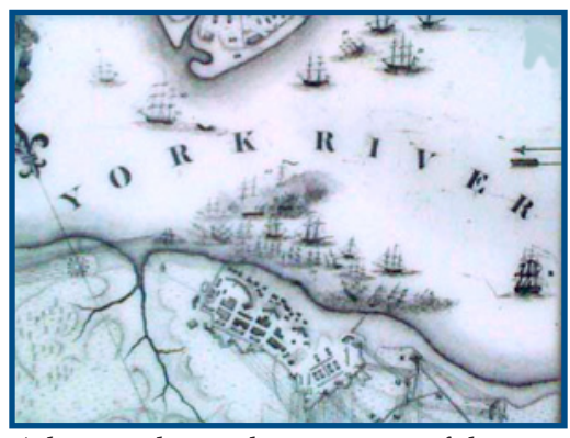
A historical map showing some of the vessels scuttled in the York River during the siege and Battle of Yorktown in 1781.

"During the first trip," says Niebuhr, "we talk about boats, and how they were built in the 18th century. We also learn about the York River ecosystem by conducting simple experiments with currents and