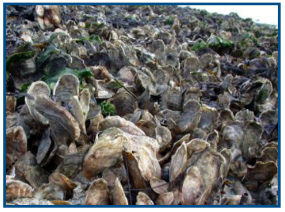
Healthy oyster reefs with large, long-lived oysters can help buffer the acidity of estuarine waters in Chesapeake Bay and other coastal ecosystems worldwide.

The study, "Ecosystem effects of shell aggregations and cycling in coastal waters: An example of Chesapeake Bay oyster reefs," appears in Ecology , the flagship journal of the Ecological Society