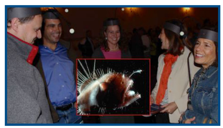
Anglerfish Hats: Audience members donned handmade anglerfish hats—a fun way to simulate the bioluminescence used by many deep-sea creatures for feeding and reproduction.

That childhood wonder has now grown into a