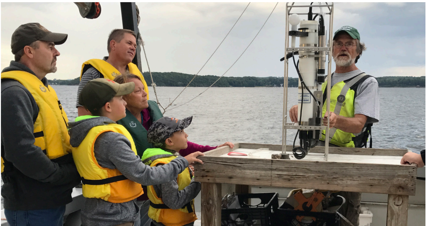
Aboard University of Vermont's research vessel, The Melosira, students learn about current research and apply scientific tools and techniques to collect data.

PROFESSIONALS AND DECISION MAKERS include local, state, regional, and national staff and officials who rely on sound science to inform their duties. These individuals play an important role in creating and enforcing policies and regulations in their communities.