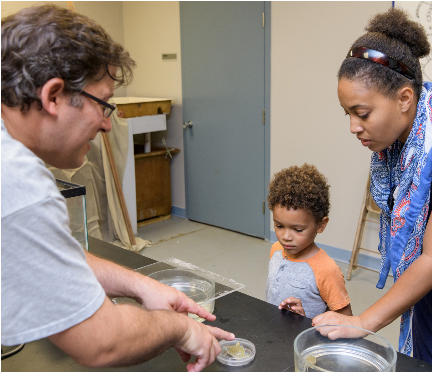
Delaware Sea Grant highlights its efforts to educate the public about coastal issues and research through its popular annual open house, Delaware Coast Day.

EDUCATORS provide ocean, coastal, and Great Lakes resources and programming to PK-12, undergraduate,