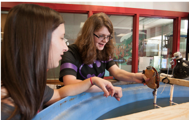
Students from Francis Scott Key High School in Maryland using aquaculture as a tool for project-based learning.

Sea Grant personnel interact directly and indirectly with a variety of audiences every day: coastal community resilience specialists collaborate with city planners to ensure that nuisance flooding is remediated and mitigated; educators bring local teachers together for professional development opportunities that enhance student learning; aquaculture specialists facilitate panel discussions to help shellfish growers navigate regulations. Achieving