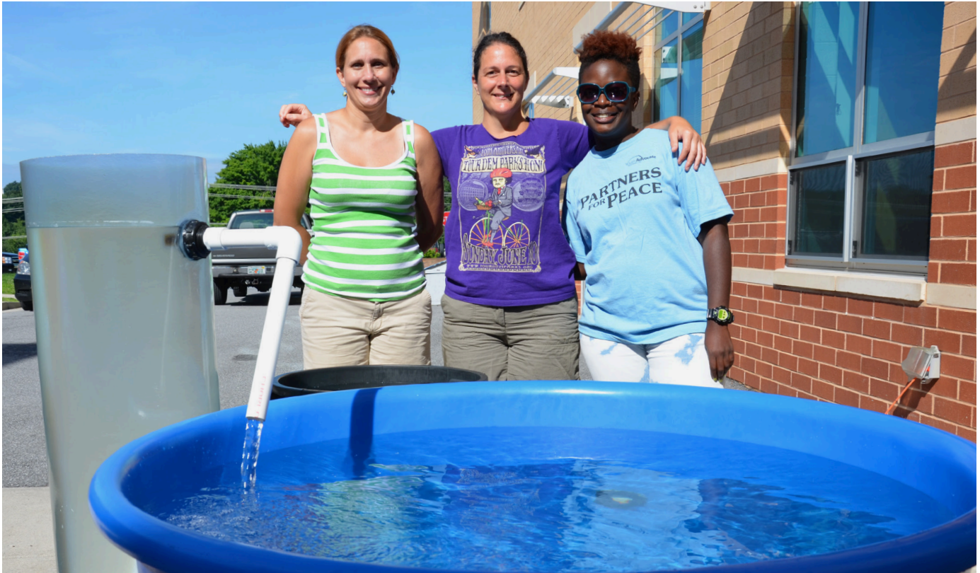
Aquaculture-in Action, Maryland teachers proudly displaying their newly constructed 260-gallon recirculating aquaculture system for use in their classrooms.

Individual Sea Grant educators, communicators, and extension agents currently apply the findings of relevant social science research to their programming, communications and outreach so that individuals and communities served by Sea Grant value and are able to use evidence-based reasoning in their decision making about ocean, coastal, and Great Lakes resources. Yet gaps remain in the application of social science research to these efforts.