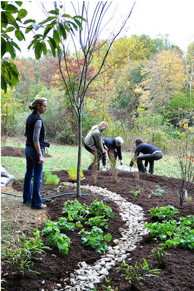
Watershed Stewards Academy volunteers in Maryland help install a residential rain garden.

education makes it strategically poised to provide: (1) life-long learning opportunities for community members that develop their environmental literacy and prepare them to take action to prevent or mitigate environmental threats; (2) training to develop community stewardship by assisting in identifying needs and facilitating individual and community-wide efforts toward sustainability.