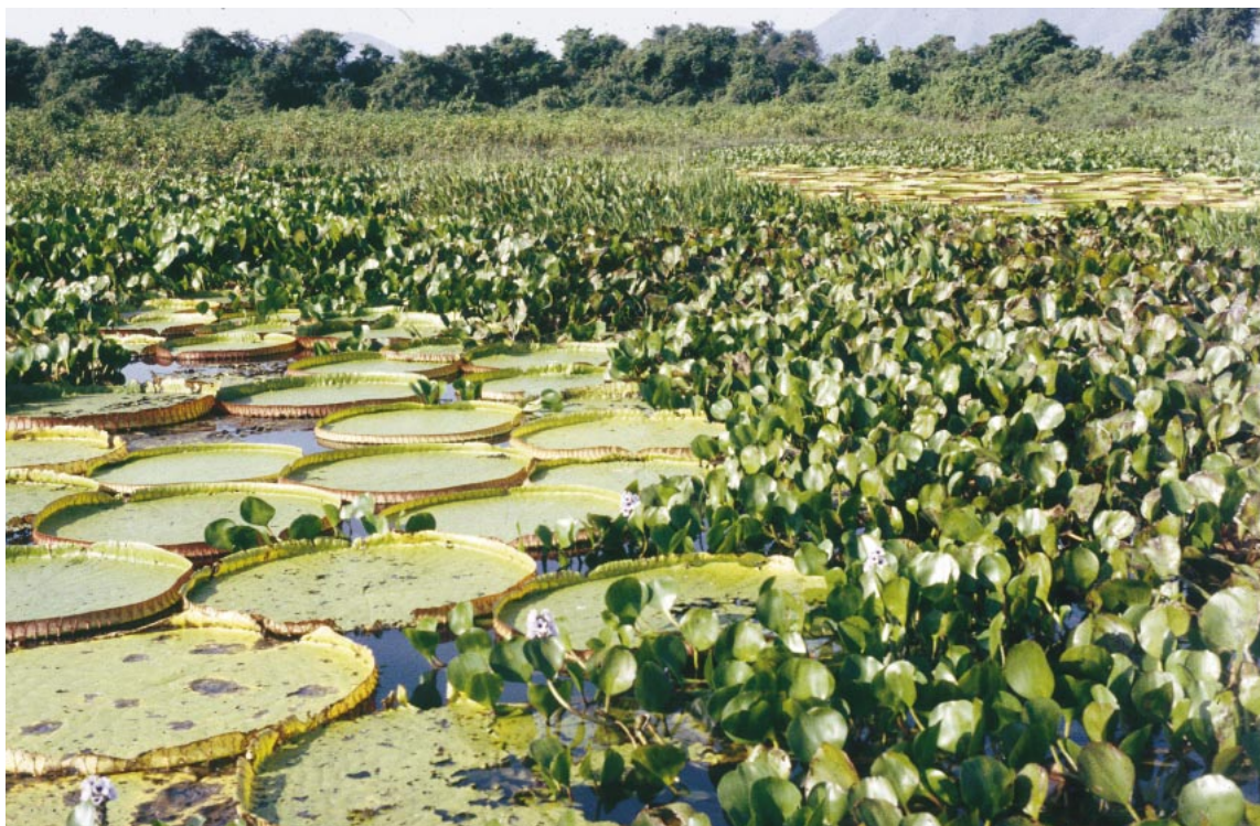
Marsh vegetation, including the water hyacinth ( Eichhornia crassipes ) and the giant water lily ( Victoria amazonica ).

centuries, may suffer greatly if grazing lands receive less flood water (and thus less nutrients) during the rainy season. Environmental costs were not fully assessed (Filho and Coelho 1997). In some ways the analysis echoed assessments made when many of the world's large rivers were developed into complex waterways—namely, the CIH analysis underestimated the long-term costs associated with environmental degradation (Sparks 1995). Only in the last couple of decades have the enormous environmental costs of such development—erosion, flooding, chemical contamination, and disruption of natural communities—become obvious.