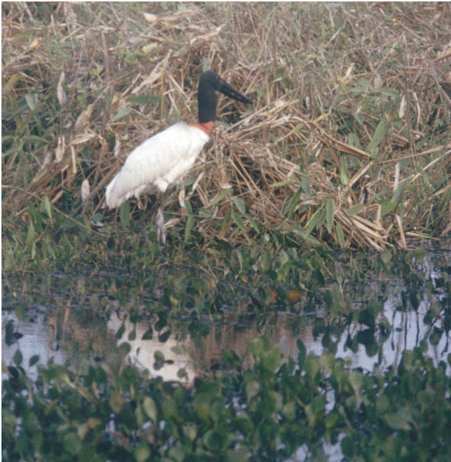
A jabiru (Jabiru mycteria), symbol of the Pantanal, feeding in a shallow flooded area.

Paraná Hidrovía, on the other hand, point to the tremendous long-term costs that these same projects have engendered, particularly in terms of what economists call externalities. These costs (monetary and otherwise), borne by someone other than the individuals using a resource, include flooding, deteriorating quality of drinking water, displaced populations, pollution, loss of wetlands and wildlife, and damage to fisheries (Bucher and Huszar 1995).