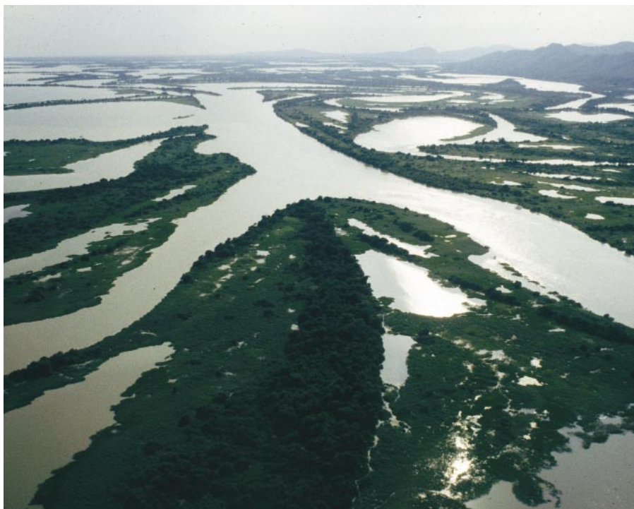
Confluence of the Paraguay and Cuiabá rivers near Acurizal.

The panel's findings were similar to the conclusions reported independently by Hamilton (1999). He used a model to predict that seemingly minor decreases in river levels might cause large losses of flooded area, particularly during the dry season, when such areas serve as critical refuges for fauna that depend on aquatic environments. For instance, lowering the level of the Paraguay River by an average of only 25 cm—certainly a realistic estimate of potential effects of the Hidrovía—would reduce the flooded area of the Pantanal by 22% at low water.