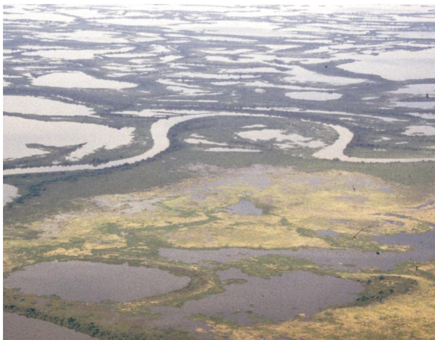
Aerial view of the Paraguay floodplain in the northern Pantanal.

Independent of the CIH assessment, Ponce (1995) focused on the hydrologic aspects of the proposed Paraguay–Paraná waterway in research sponsored by the Mott Foundation.