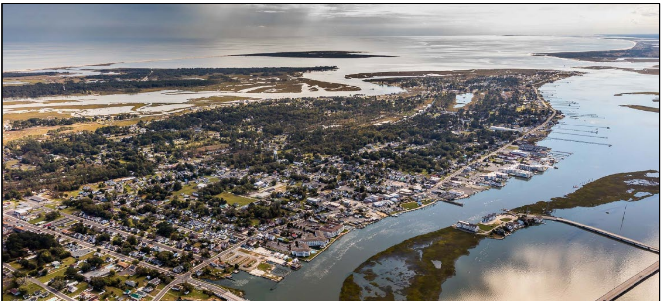
Figure 1: Chincoteague Island with southern Assateague Island (far left and center) and northern Wallops Island (far right).

The region surrounding Chincoteague Inlet and adjacent Chincoteague, Assateague, and Wallops islands is a dynamic system experiencing rapid change associated with sediment redistribution (erosion and deposition) and shifting navigation channels. Understanding the rates and causes of sediment movement throughout this system is critical to developing a regional management plan and testing shoreline management strategies that are protective of the Town of Chincoteague, the Mid-Atlantic Regional Spaceport and the NASA Flight Facility on Wallops Island, and southern Assateague Island.