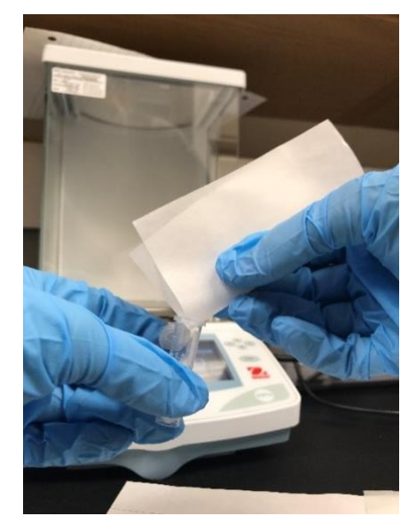
Figure 5: Demonstration of transfer of C14 "dust" from weighing paper to collection tube.