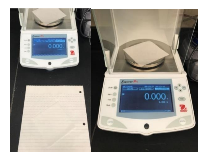
Figure 3: Example of Step 8 with scale, weighing paper, and blank sheet of paper.