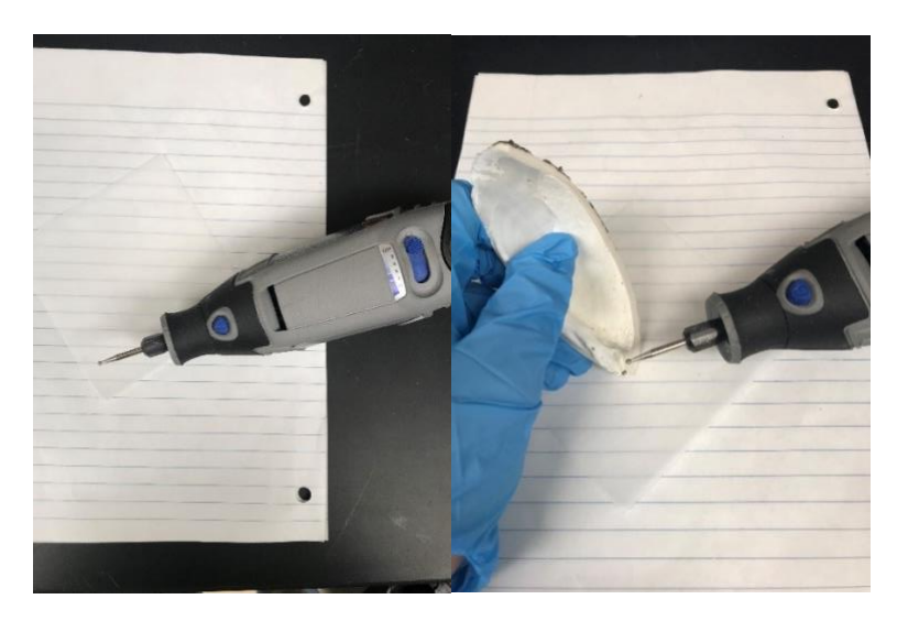
Figure 4: Dremeling the C14 collection from the shell.