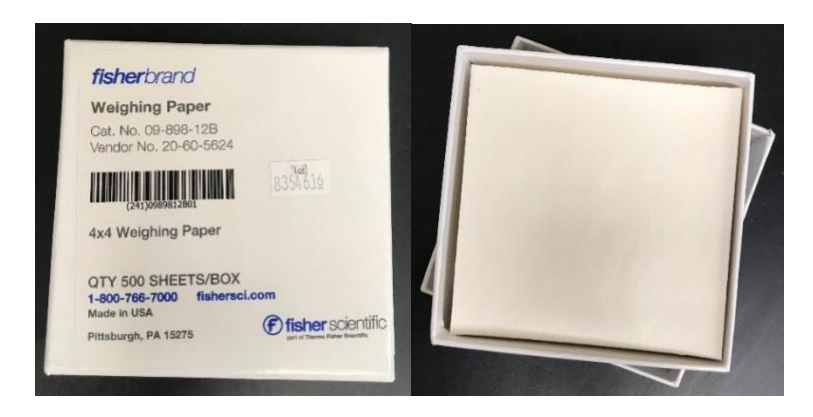
Figure 2: Example of weighing paper for C14 "dust" collection.

4. Gather C14 collection supplies: weighting paper (Figure 2), gloves, scale, black sheet of paper, Dremel tool, and 2.0 mL centrifuge tubes.