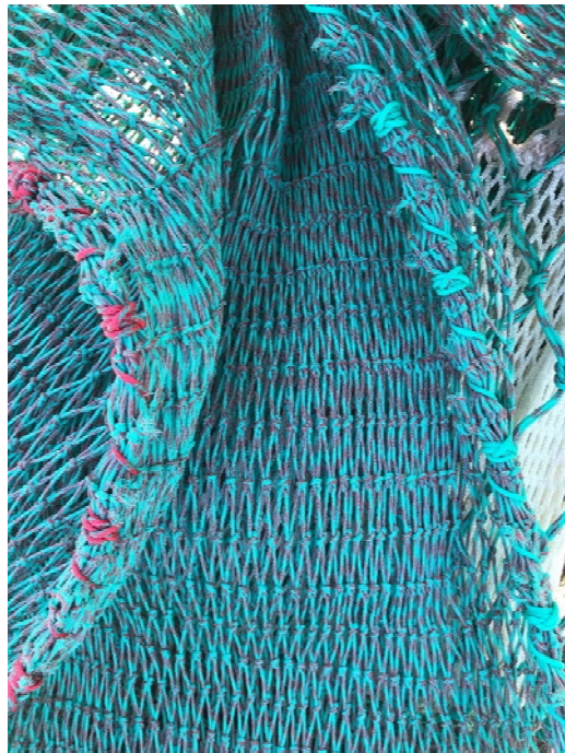
Figure 2. Port and starboard gores wrapped in respective colors. Net constructed using green PE twine with a red tracer.