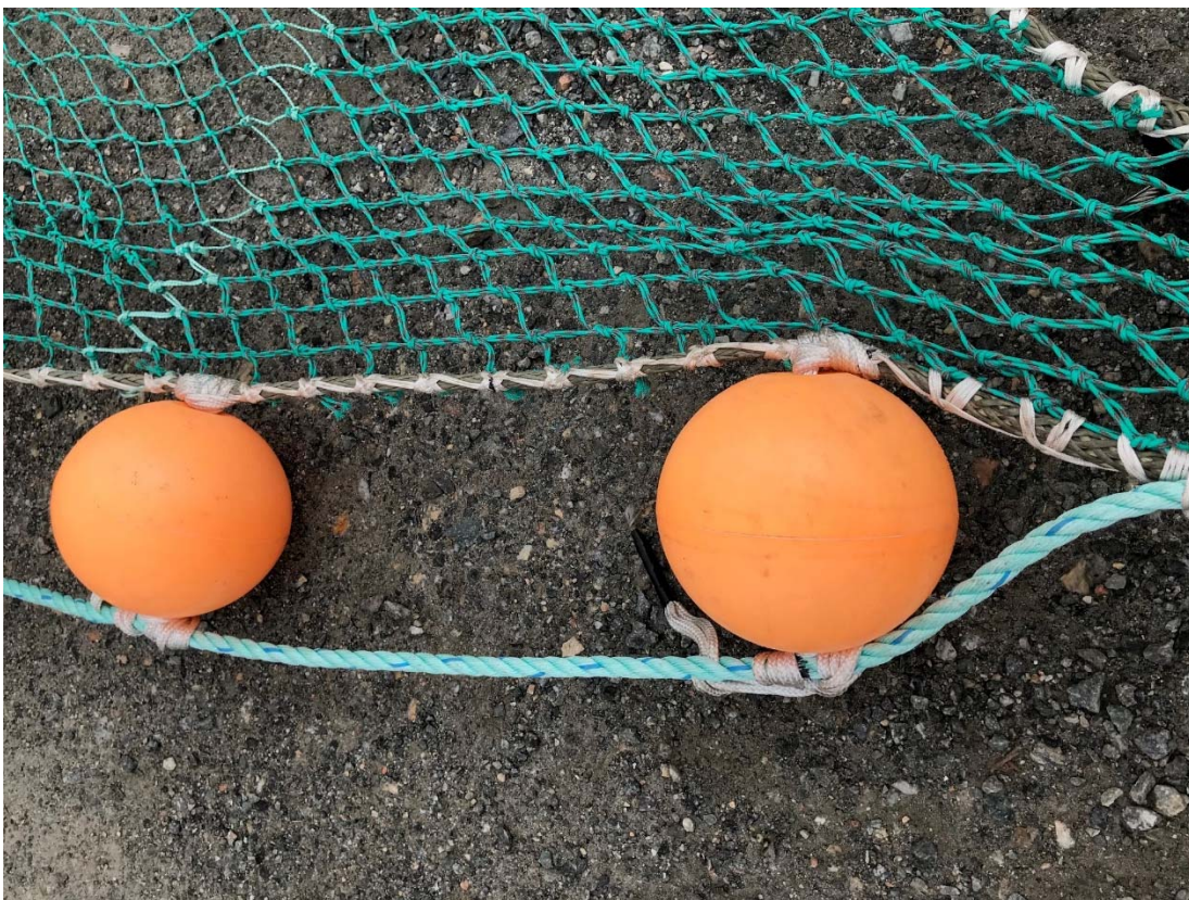
Figure 4. Headrope and floatline with 8" center-hole floats spaced 2' apart