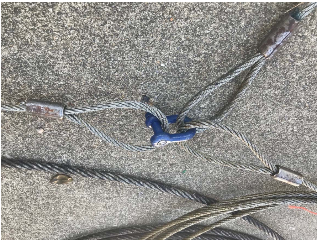
Figure 14. Both the upper and mid bridles joined to a single 3/16" bridle wire via a 3/8" straight "D" shackle