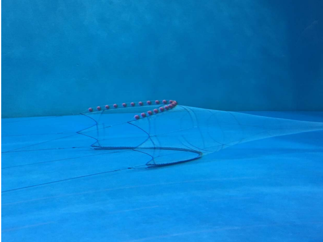
Figure 1. View of the 200x12 trawl in the flume tank in Newfoundland, Canada. Note: Since this picture was taken, the number of floats has been lessened from 20 (pictured above) to 16 due to brand preference and buoyancy specifications