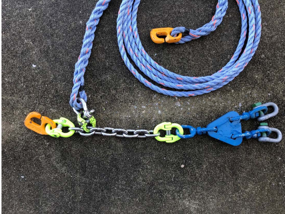
Figure 13. Main hookup. Top: Idler seen coiled – Viking Link for switching connections between door (while fishing) and net drum idler (while setting and/or hauling). Left: Viking Link used to connect this main hookup to the backstrap extension wire. Right: Swivel plate connecting the main hookup to the single top bridle (before the split), and the bottom bridle via \frac{1}{2} " straight "D" shackles.