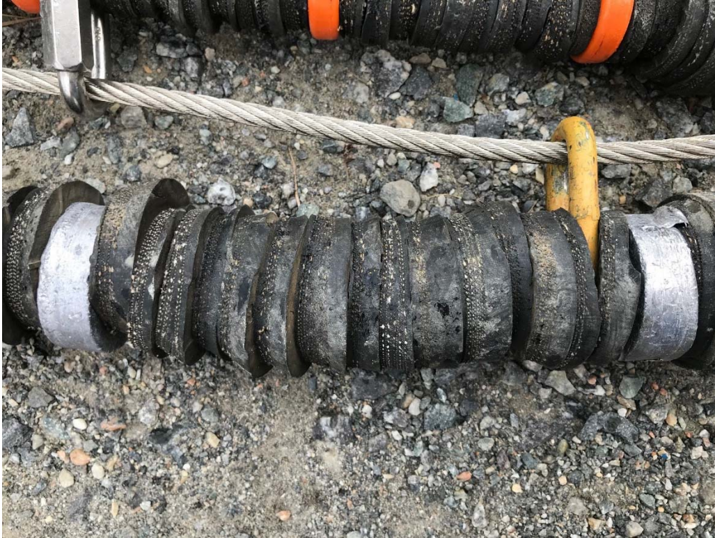
Figure 9. Flat sweep cookies, 1-linkers, and 1-pound lead spacers