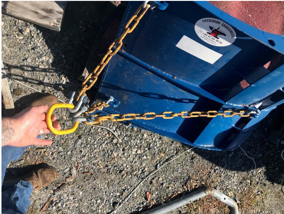
Figure 12. Backstrap chains and master-link. Forward thimble of backstrap extension wire is connected here via a ½" s/s bow shackle