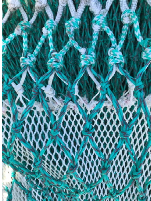
Figure 3. Codend and codend liner attachment