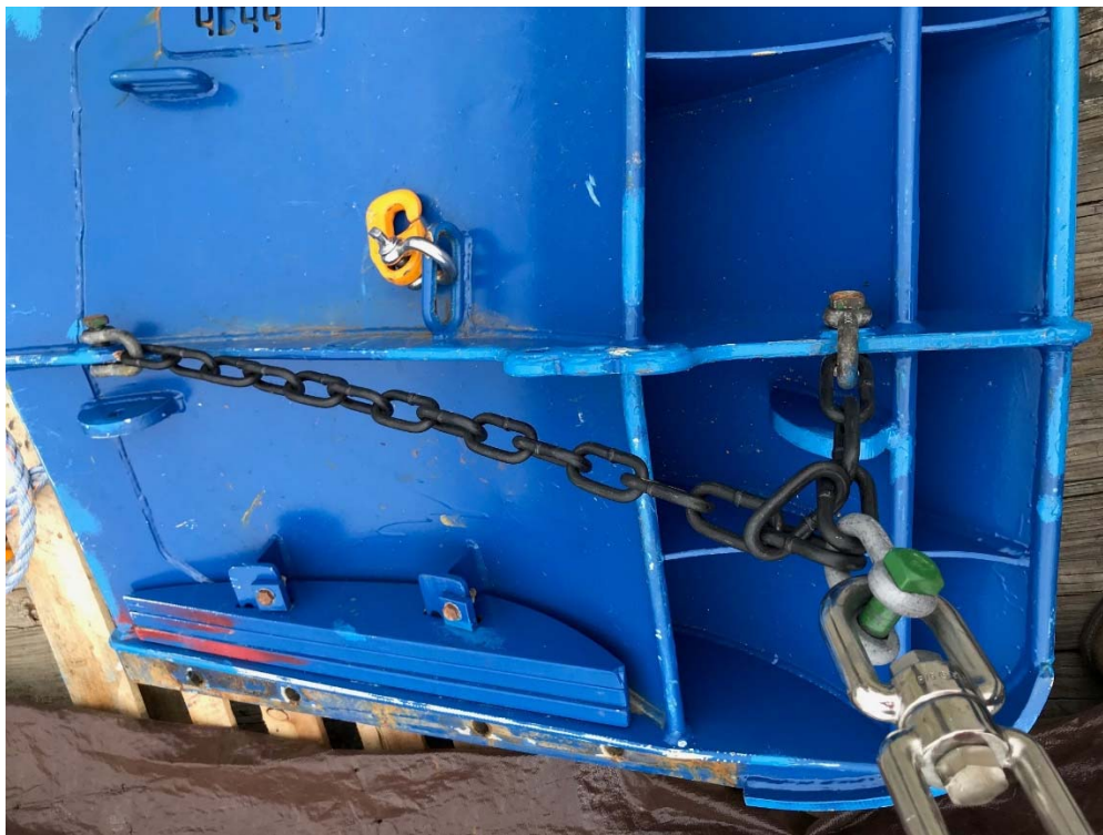
Figure 10. Thyboron Type IV 44" trawl door used on the ChesMMAAP survey. Tow-point swivel and shackle connected to the trail chain, through links 3 and 5. In the stationary link above the trail chain is the Viking Link used to connect the idler to the trawl door while towing. Note, knife edges have been removed in photo for storage purposes