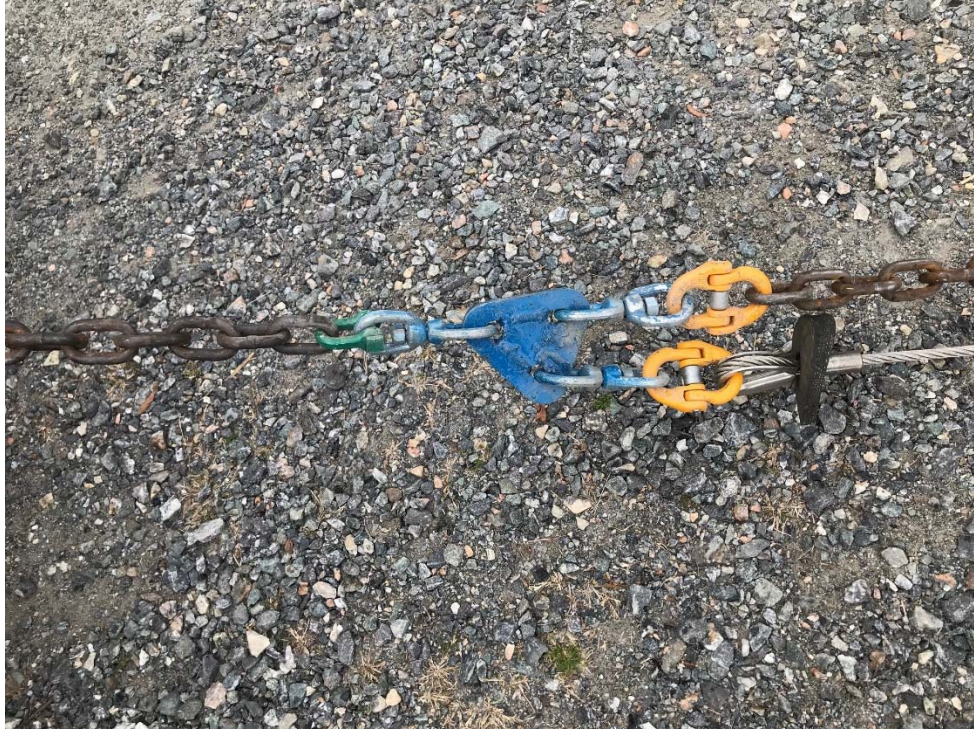
Figure 7. Footgear extensions connection to the bottom swivel plate