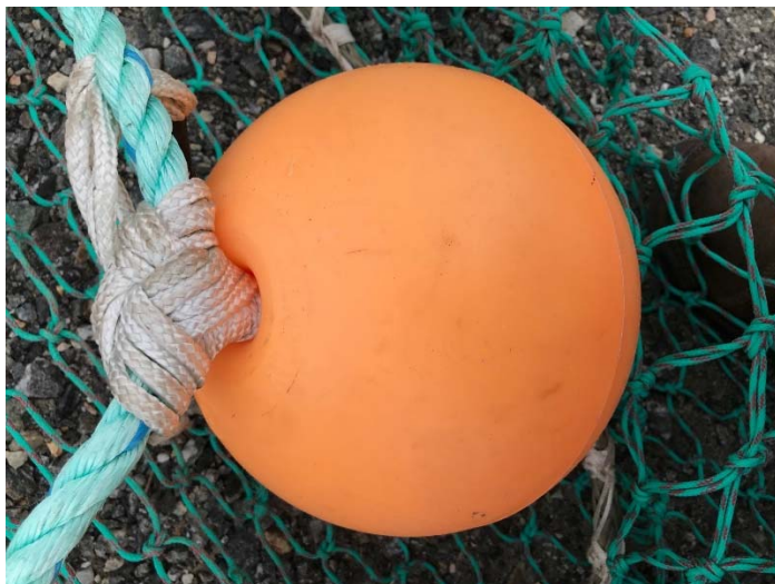
Figure 5. Attachment of center-hole float using #8 polyester twine