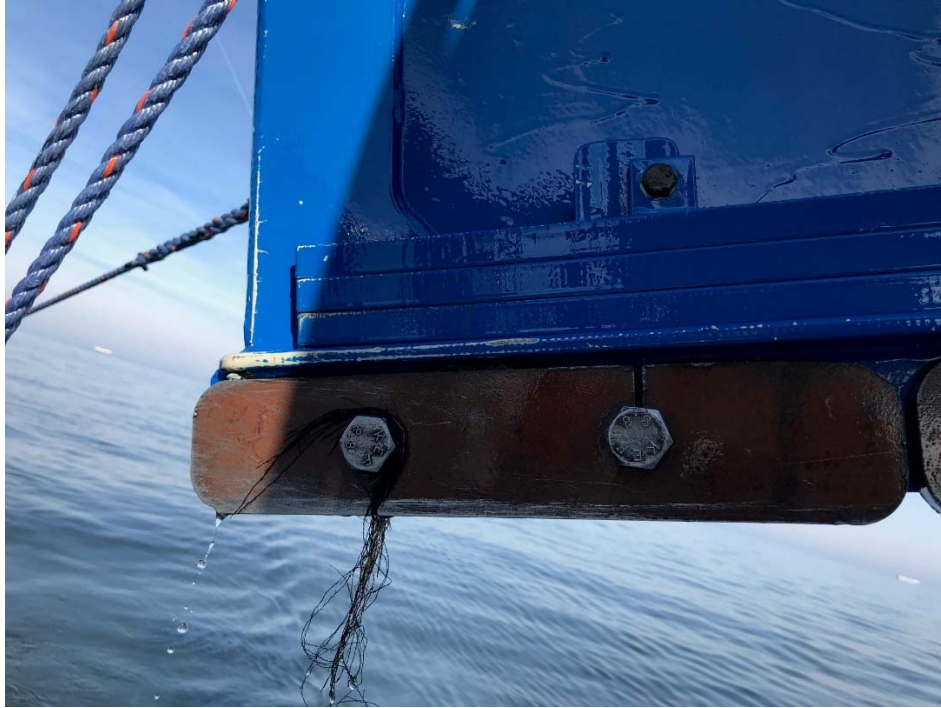
Figure 11. Trawl door outfitted with knife edges