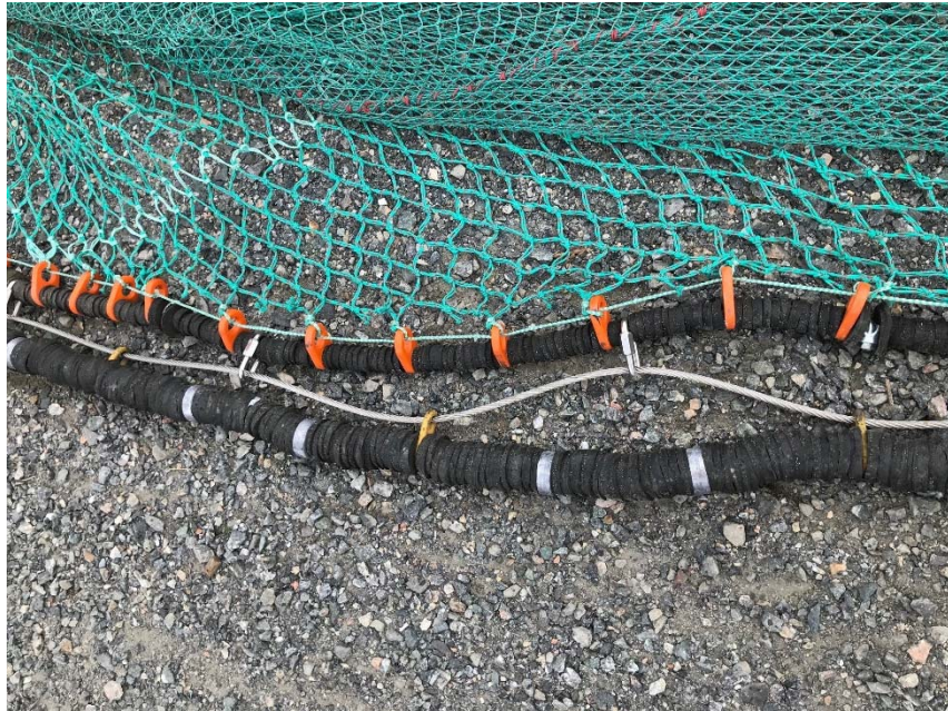
Figure 8. Zipper traveler connecting the footrope to the flat sweep